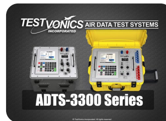
ADTS-3300 Series Software

sets. ADTS4X5F software provides automated test and calibration for the ADTS405F, ADTS415F and DPS500 (and variants); EccADC software provides automated test and calibration for TTU-205J; and ADTSCal software provides automated test and calibration for ADTS-3350ER, ADTS-3350MR, ADTS-3300JS. The applications provide increased test consistencies while lowering touch labor hours and costs for testing and calibration.