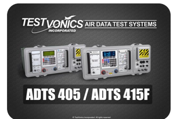
ADTS 405F / 415F Software